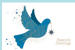
Peace Dove Code: DO444 Gold foil