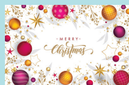
Beautiful Baubles Code: BA488 Gold foil