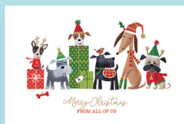
Puppy Team Code: FE394 Gold foil