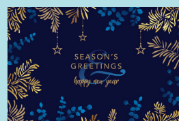
Twinkling Greetings Code: FE442 Gold foil