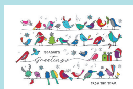
Tweet from the Team Code: FE423 Silver foil