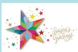
Shining Star Code: ST483 Gold foil