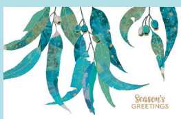
Floral Greetings Code: AU304 Gold foil