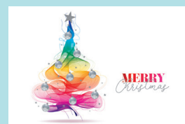
Shimmering Tree Code: TR481 Silver foil