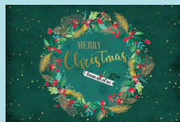
Christmas Berries Code: WR439 Gold foil