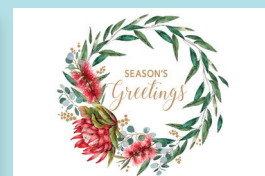
Australian Wreath Code: WR496 Gold foil