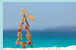
Beach Christmas Code: FE448