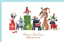
Puppy Team Code: FE394 Gold foil