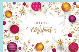
Beautiful Baubles Code: BA488 Gold foil