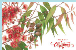
Gum Blossom Greetings Code: AU399