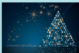
Sparkling Tree Code: TR365 Gold foil