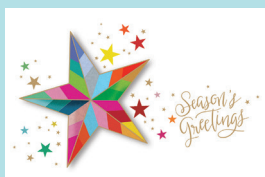
Shining Star Code: ST483 Gold foil