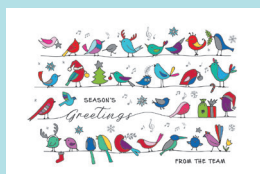
Tweet from the Team Code: FE423 Silver foil