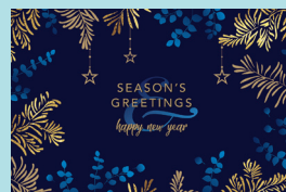
Twinkling Greetings Code: FE442 Gold foil