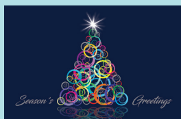
Glowing Tree Code: TR450 Silver foil