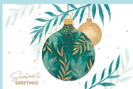
Eucalyptus Greetings Code: BA457 Gold foil