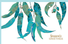
Floral Greetings Code: AU304 Gold foil