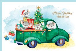
Christmas Delivery Code: FE270 Gold foil