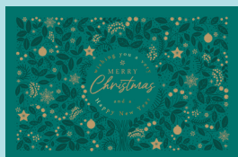
Christmas Decorations Code: FE411 Gold foil