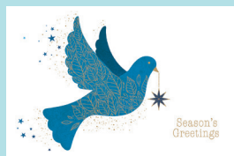
Peace Dove Code: DO444 Gold foil