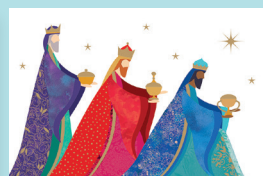
Magnificent Kings Code: RE333 Gold foil