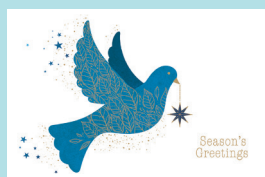
Peace Dove Code: DO444 Gold foil