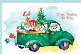
Christmas Delivery Code: FE270 Gold foil