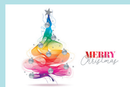
Shimmering Tree Code: TR481 Silver foil