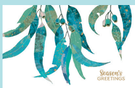
Floral Greetings Code: AU304 Gold foil