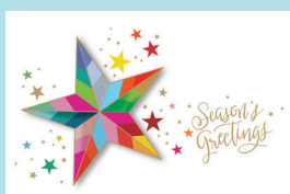
Shining Star Code: ST483 Gold foil