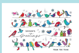
Tweet from the Team Code: FE423 Silver foil